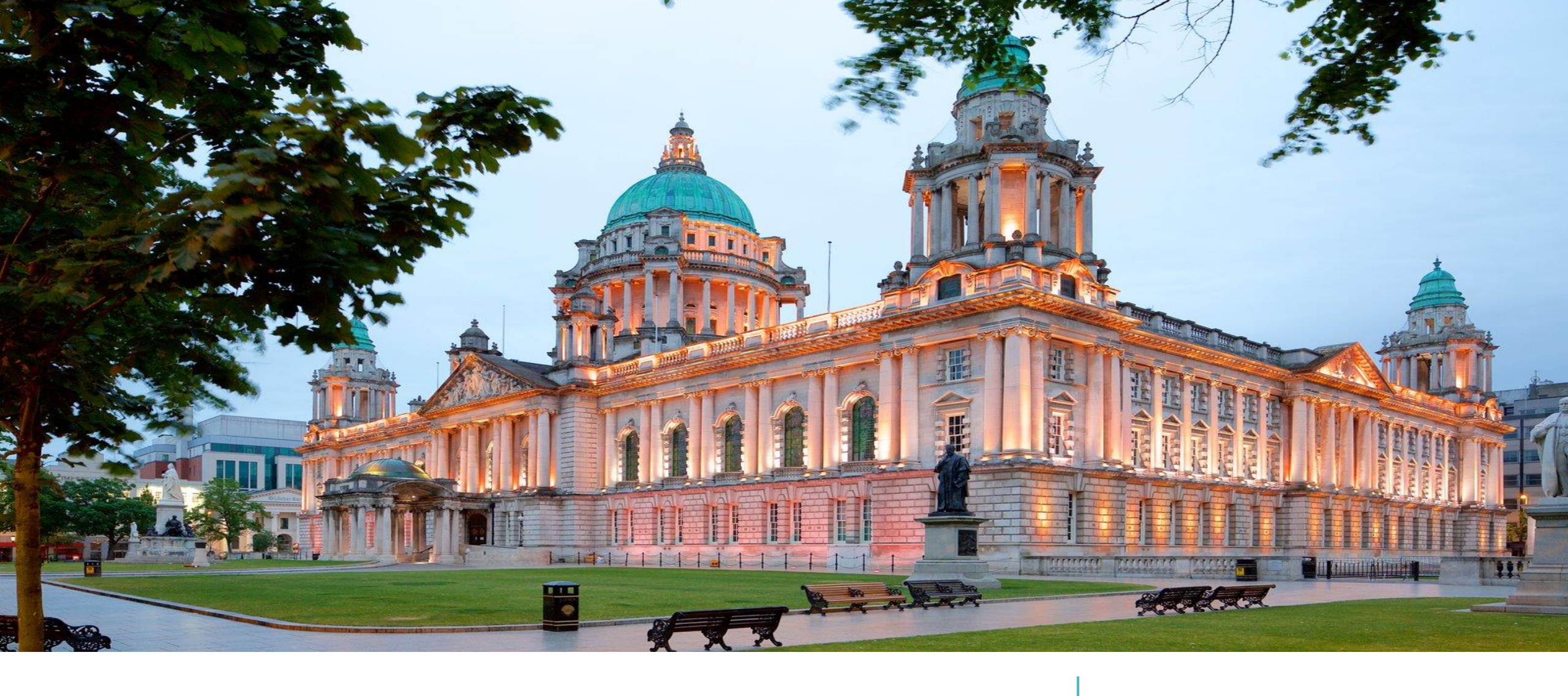
FAQS, SUPPORT & CONTACTS